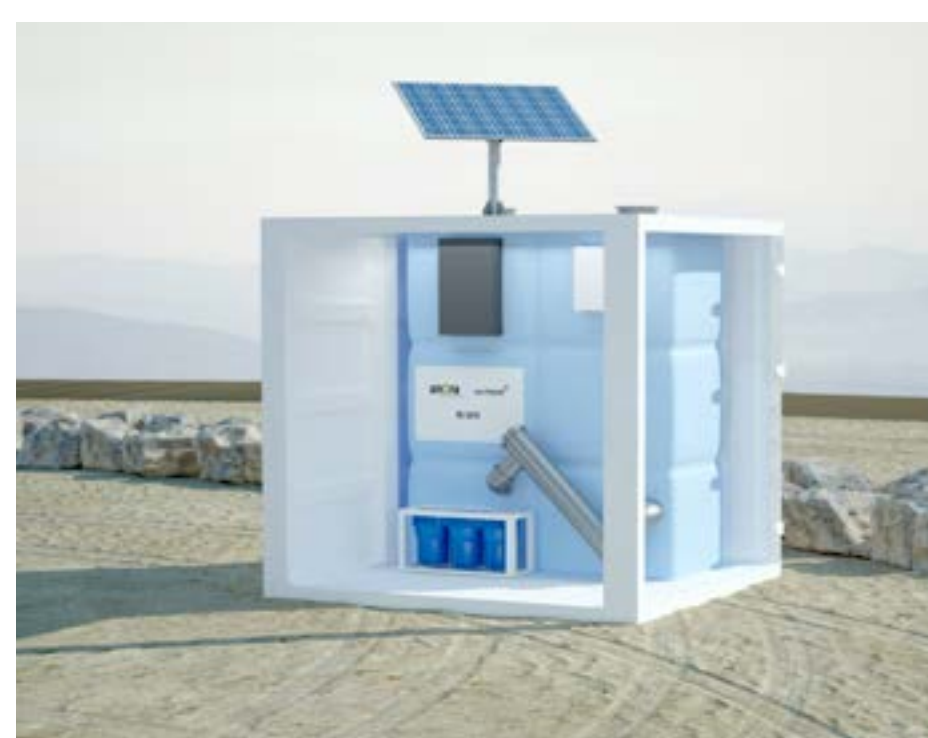
FOUNTAIN CONTAINER FOR ONE TANK. INTERIOR VIEW.