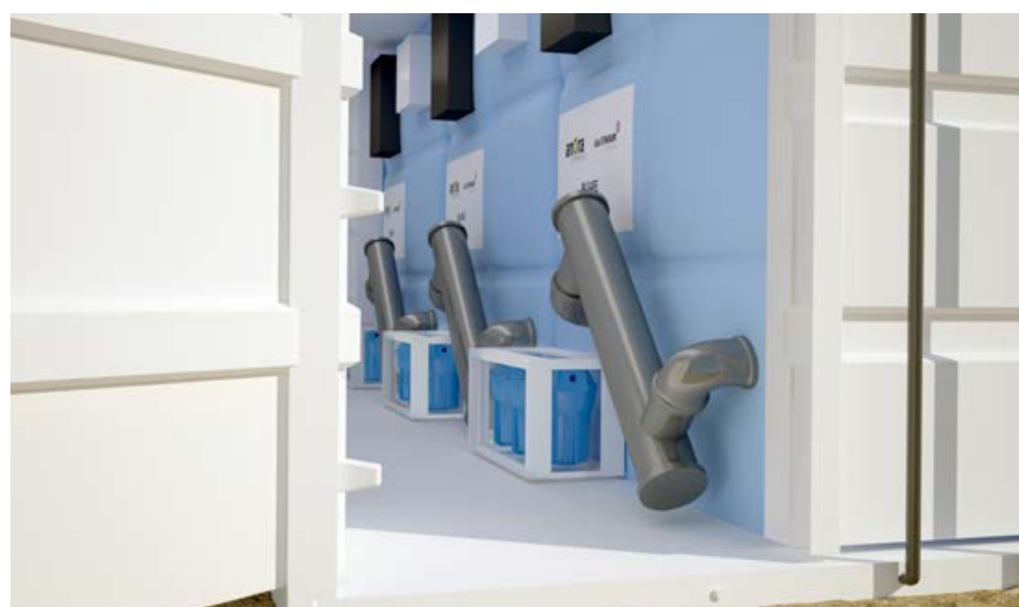
H2O TITANIUM WATER PURIFIER. INTERIOR VIEW. 3 TANKS - 6 REACTORS