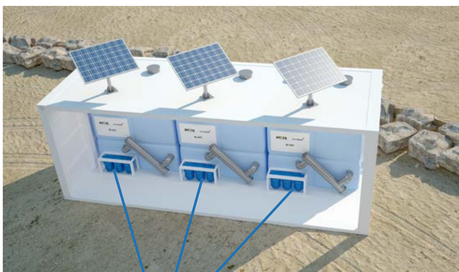
EAGLE VIEW. TANKS ACCESSES FOR CLEANING