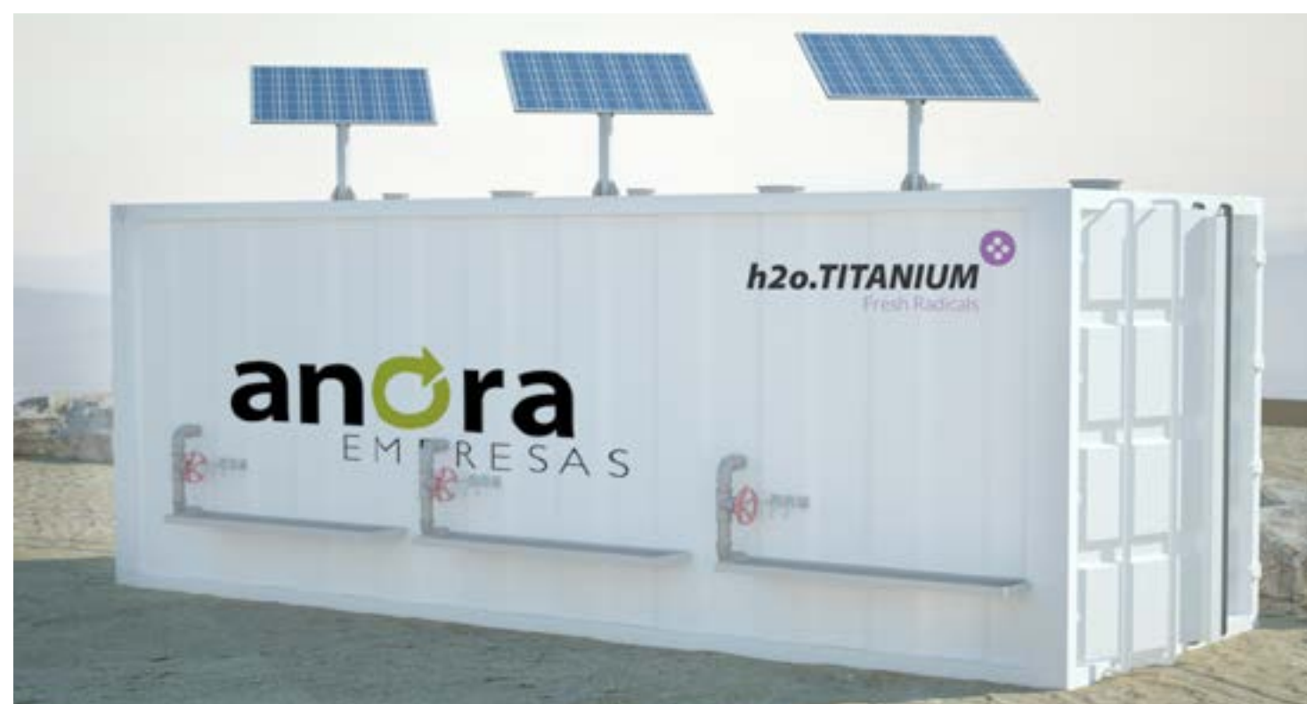
H2O TITANIUM FOUNTAIN 9 TABS SERVICE 1'5 m 3 /h.