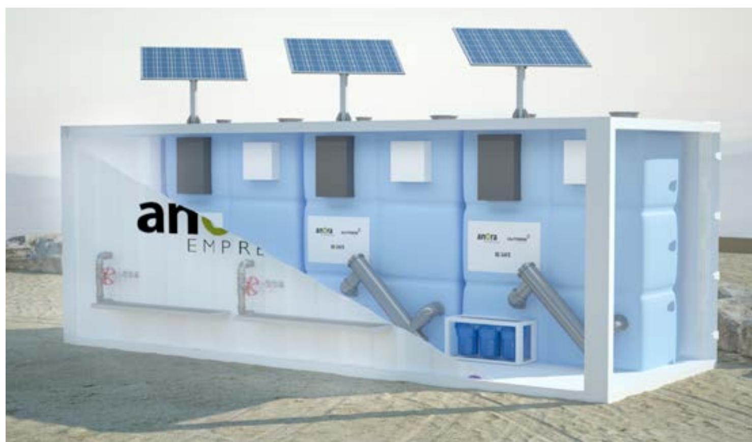
INSIDE VIEW. SECTION 20 m 3 CAPACITY. AUTONOMOUS - SOLAR CELLS