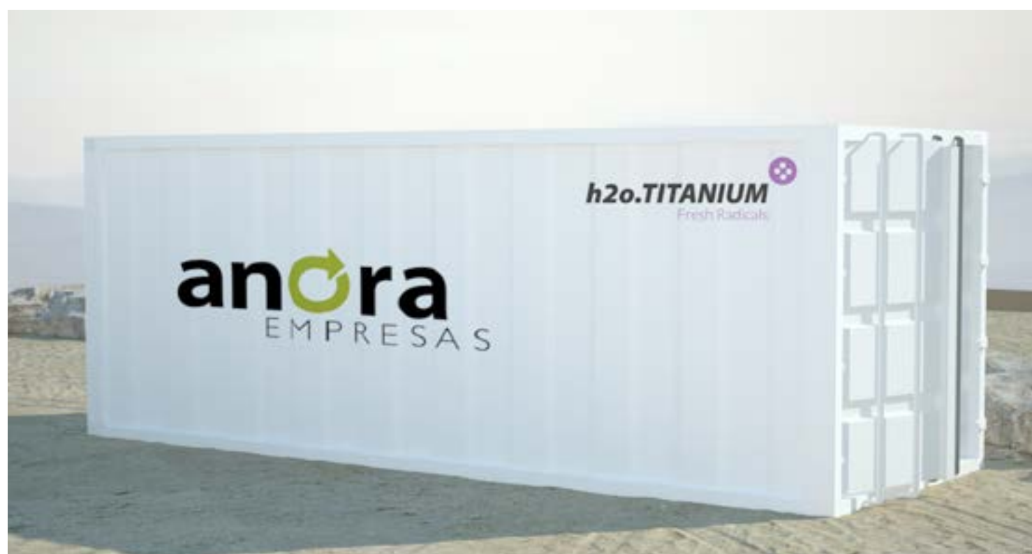
STANDAR 20" CONTAINER