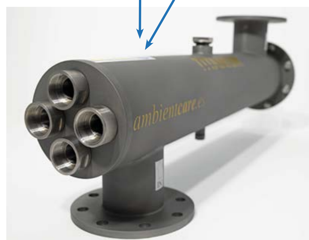
DETAIL OF THE REACTOR. 5-20 m 3 /h.