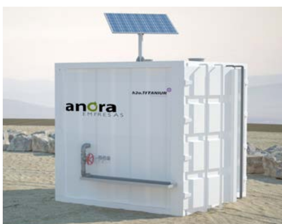
FOUNTAIN CONTAINER FOR ONE TANK. 500 l/h SERVICE.