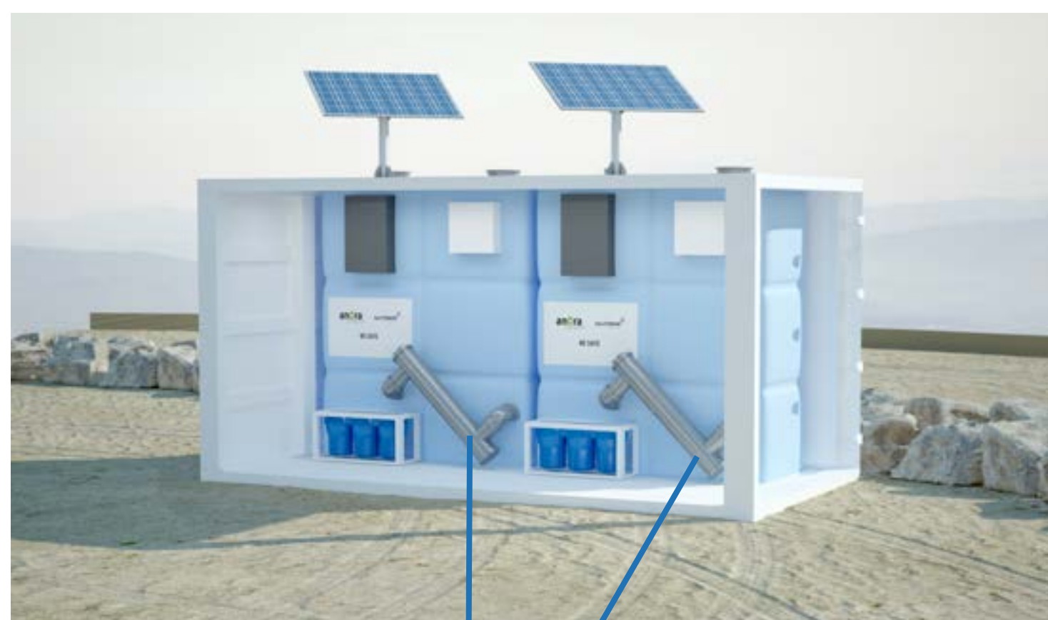
H2O TITANIUM FOUNTAIN 2 TANKS - 4 REACTORS